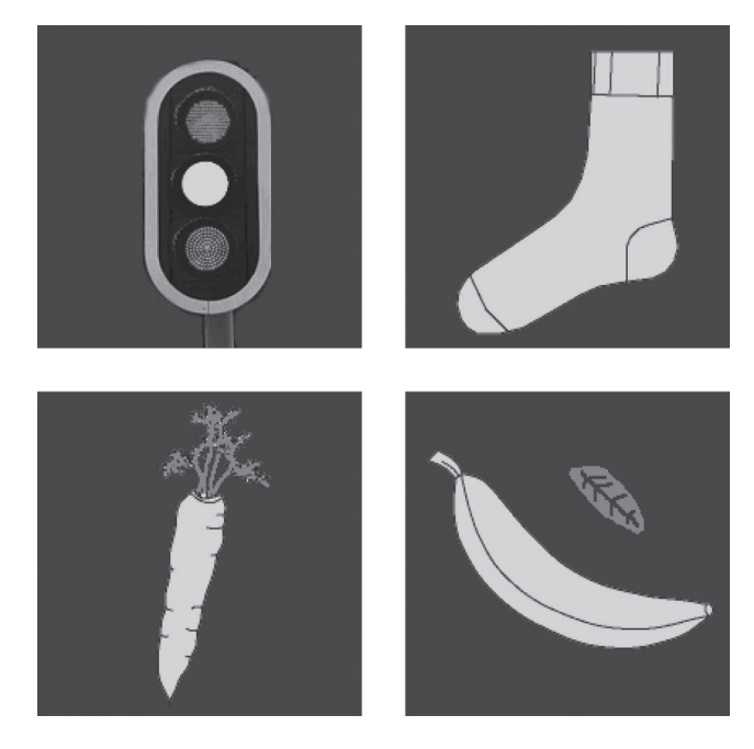
Figure 2. The four stimuli used in this experiment.

All experiments were run in a completely darkened room with a 15-in. LCD monitor (Iiyama TXA3823MT) as the only source of light. We generated a continuum of six hues from yellow to orange. The Commission internationale de l'éclairage (CIE) XYZ coordinates of these hues were as follows: Hue 1: [60.0, 53.8, 8.5]; Hue 2: [61.4, 57.4, 9.0]; Hue 3: [63.9, 60.3, 9.4]; Hue 4: [65.7, 64.3, 10.2]; Hue 5: [67.6, 67.6, 10.8]; Hue 6: [69.8, 71.5, 11.5]. These hues were then placed on four different pictures (see Figure 2): a traffic light with the middle light being "on," a sock, a banana, and a carrot. These four pictures and six hues led to 24 experimental stimuli. These stimuli were presented to the participants with the Presentation software (Version 11.26).